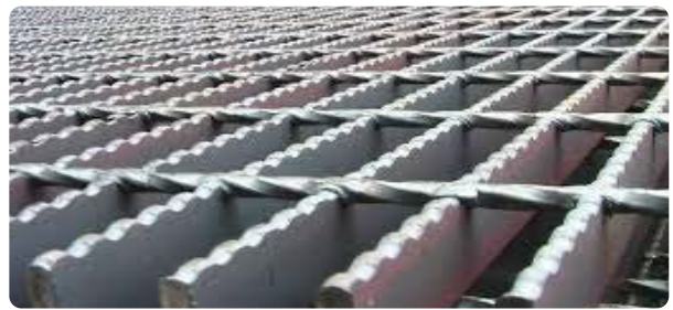
SERRATED SURFACE-GALVANIZED FINISH

Bar grating is the most widely used flooring for stairs, mezzanines, walkways, Catwalks, and trenches. It is very durable for rugged applications where strength, Safety, and cost are considerations.