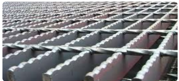
SERRATED SURFACE-GALVANIZED FINISH

Bar grating is the most widely used flooring for stairs, mezzanines, walkways, Catwalks, and trenches. It is very durable for rugged applications where strength, Safety, and cost are considerations.