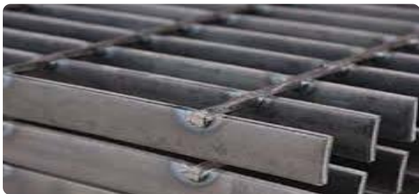
SMOOTH SURFACE-MILL FINISH

Steel cities steels offers a full range of bar grating products in plain carbon steel, Galvanized, painted black, heavy duty, aluminum and stainless. We also provide Services such as trench measurement, material identification, measurement of Grating/stair treads, and offering load tables. Please consider us for your next Project.